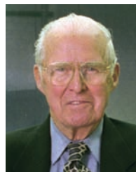
Norman Ernest Borlaug

Norman Ernest Borlaug , known as the "father of the green revolution," truly demonstrated the meaning of humanity and what a profound impact the dedication and passion of one scientist can have on the