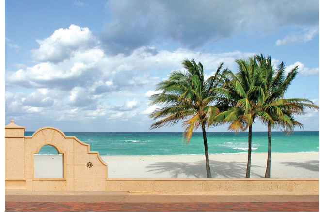
Boardwalk Beauty

The 2012 meeting will continue the focus on AACCI's 7 Key Scientific Initiatives, helping attendees determine which sessions apply to their work and ensuring the advancement of these areas